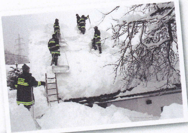
After heavy snowfalls roofs have to be freed from snow to avoid damage.

Remember: News presenters read their text on a screen you can't see. If you don't have a screen, you can use a piece of cardboard.