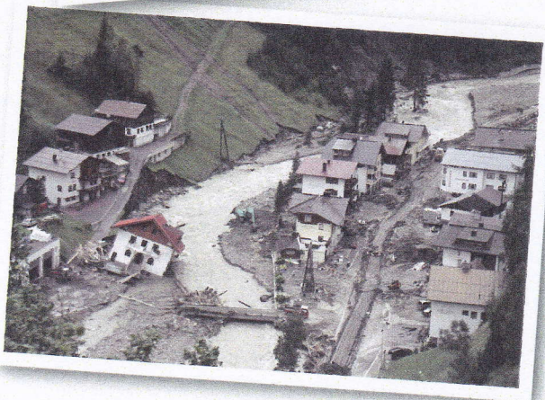
A village has been cut off by floods.